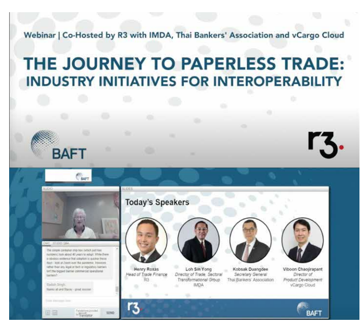
Source: Webinar | The Journey of Paperless Trade: Industry Initiatives for Interoperability

Many outreach activities have shifted to the online space due to current global physical distancing restrictions. Here are some of the virtual events that have contributed to fruitful discussions with the industry.